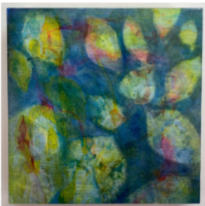
Apple leaves, morning dew

4" x 4" acrylic and fiber on birch panel. $30 each