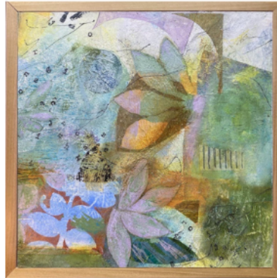
Spring Flows Poetic I

Each are 12" sq. mixed media, acrylic on watercolor paper mounted on birch panel; custom wood frame. $250 each.