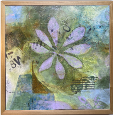
Spring Flows Poetic II

These three are available through Jan. 5 at the New Mexico Art League Small Works Show & Sale The Art League is closed for the holidays Dec. 24 through Jan. 2. Shop these works from Tues., Jan. 3 - Sat., Jan. 7 10 am - 4 pm 3409 Juan Tabo Blvd. NE, Albuquerque