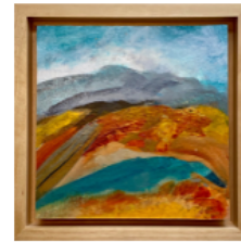
Non essential #6

6x6" acrylic, mixed media on watercolor paper, mounted on birch panel, wood frame. $160